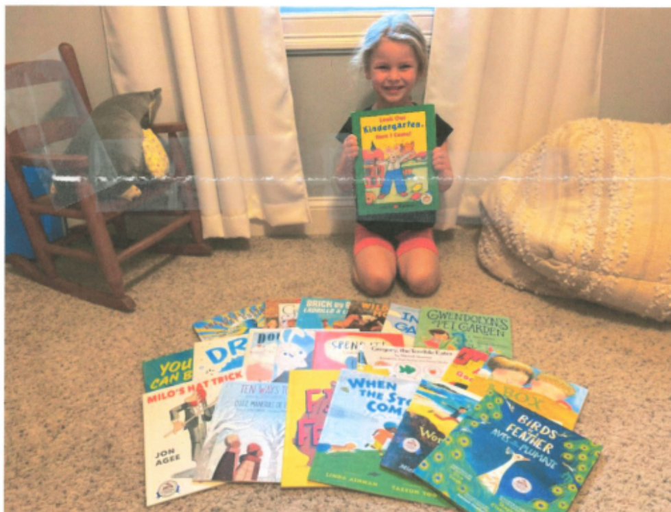
Daphne Yvon, Age 5